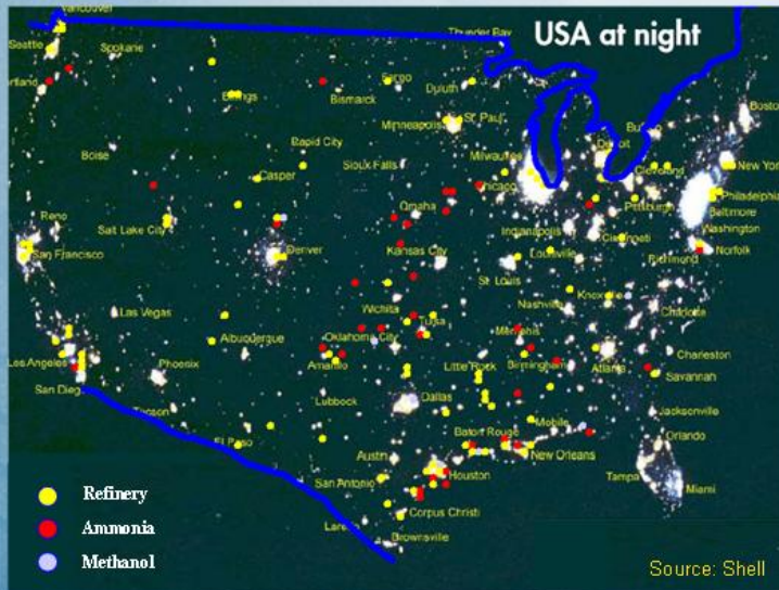
Existing U.S. H2 Infrastructure

Large hydrogen production sites are already within reach of most major U.S. metropolitan areas (roughly 70% of the U.S. population)